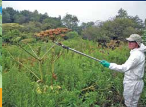
Removing seed heads

Its sap can cause painful burns, permanent scarring and even blindness.